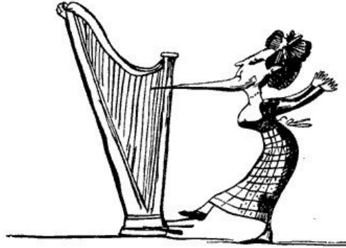
Illustration: Edward Lear 1846 (public domain)

There was a Young Lady whose chin Resembled the point of a pin; So she had it made sharp, and purchased a harp, And played several tunes with her chin. (Edward Lear, "A Book of Nonsense", 1846)