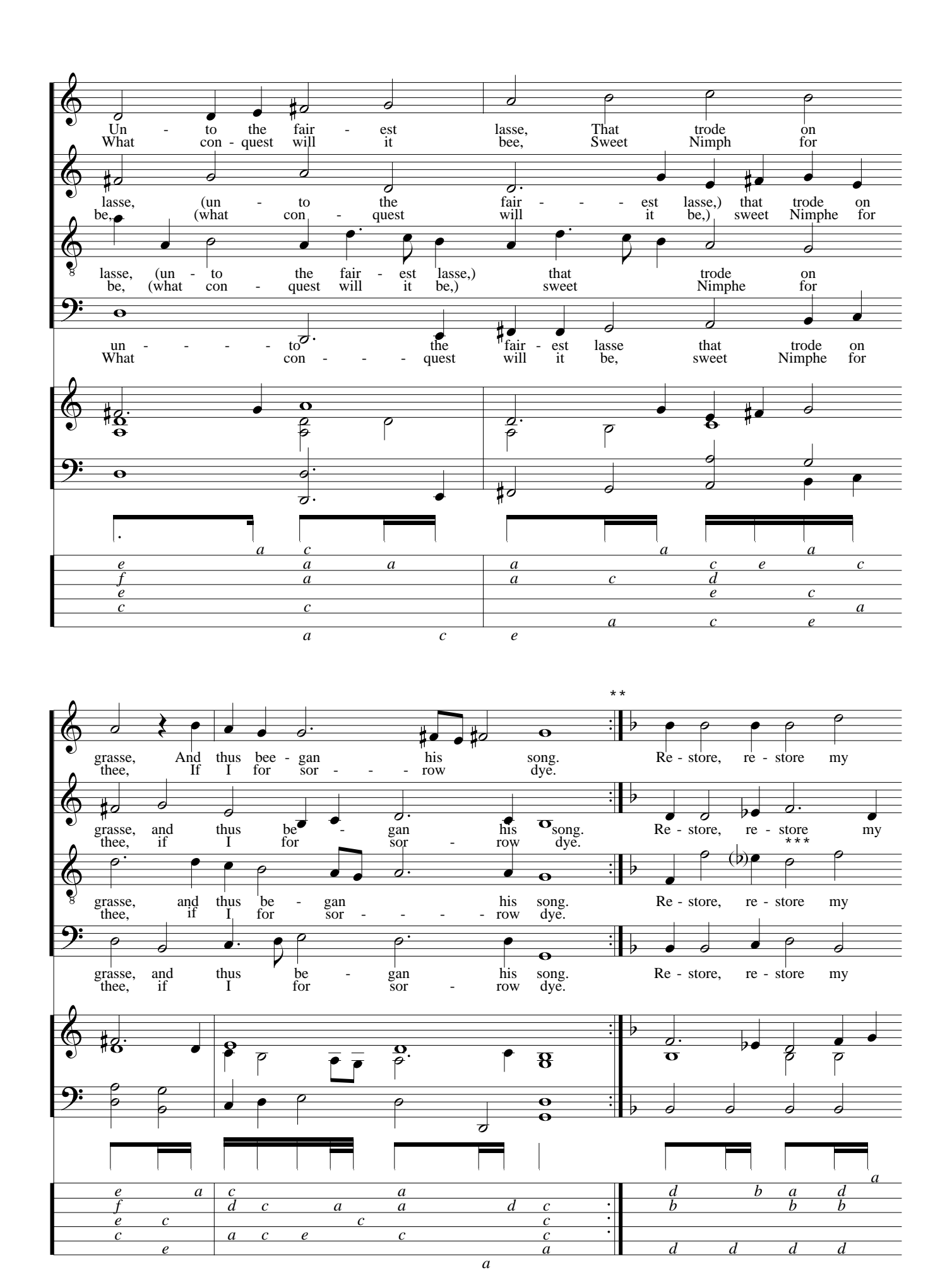
A shepherd in a shade p. 3