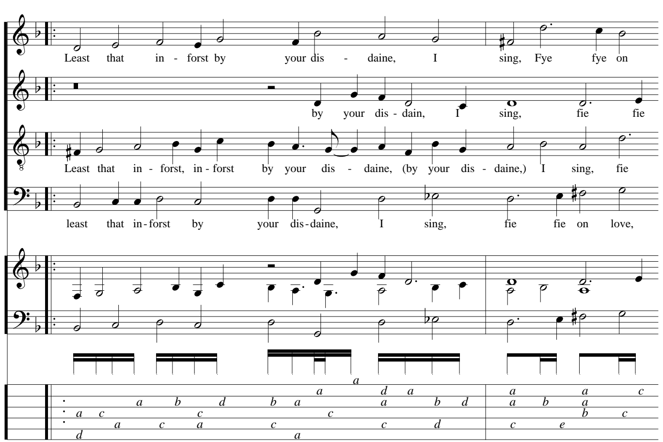
A shepherd in a shade p. 4