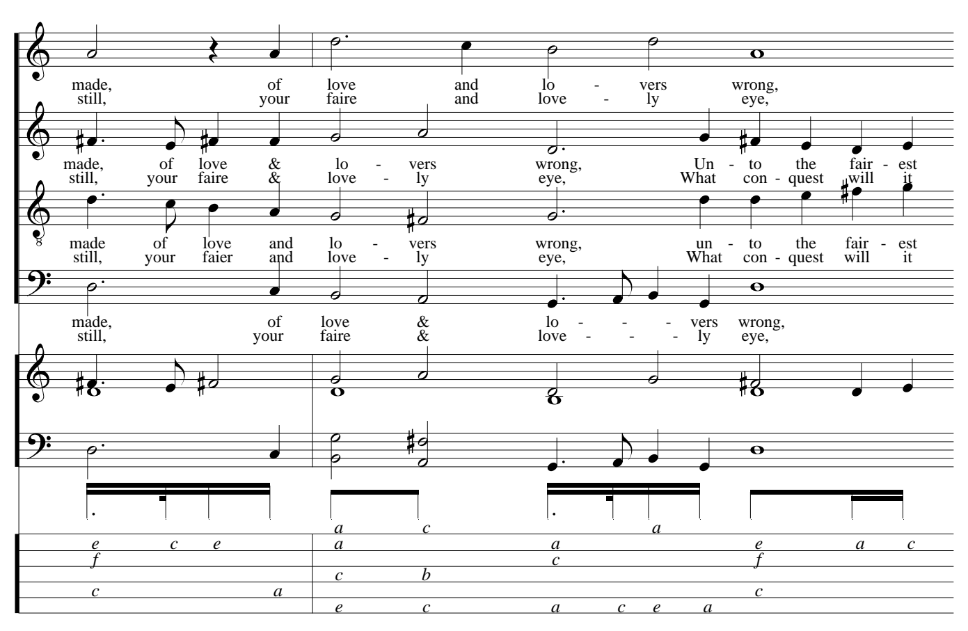
A shepherd in a shade p. 2